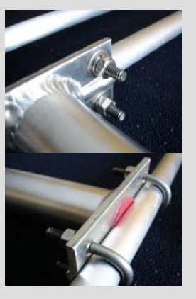
Heavy-duty dipole fixture